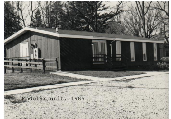
Modular unit, 1985

District moves a modular unit onto a site at 6021 Northwest Blvd. in Davenport.